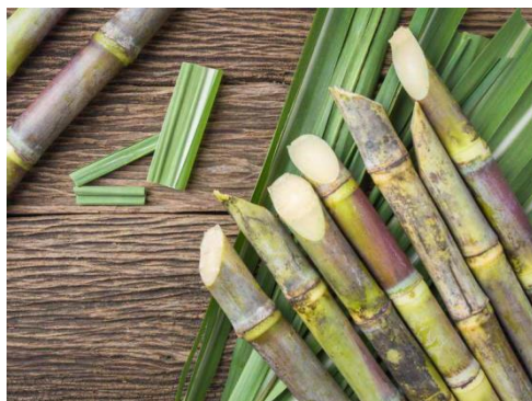
Small pieces of sugarcane

Cultivation: The land is neatly and thoroughly prepared by one or two deeps ploughings—these should be followed by clod-crushing by a clod-crusher. Compost, cattle manure and other organic manures should be applied well in advance to the land before planting. Sugarcane is propagated by 30-50 cm long 3-budded stalks or cuttings – these are known as “setts” or seeds. There are three methods of planting: 1. Flat planting, 2. Furrow planting and 3. Trench planting.