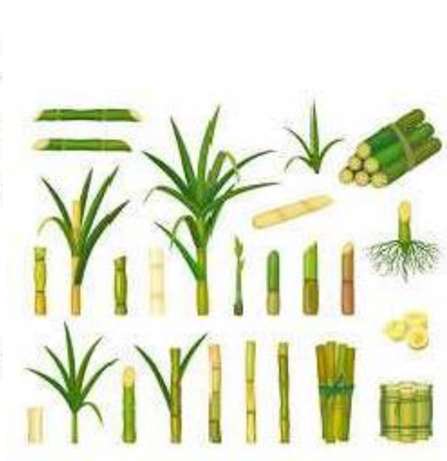
Different parts of sugarcane