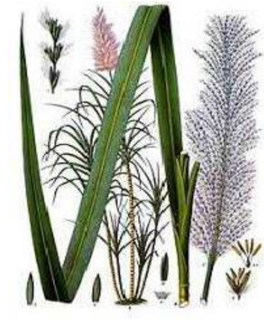
Leaf and Inflorescence

Racemose is the spikelets arrangement and both male and female parts are present on the stalk but not all produce fertile pollen. Sugarcane is thus grown vegetatively, by using the cuttings/setts of cane.