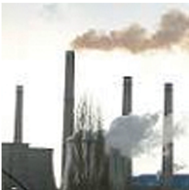
Fig. 18.2 : Smoke from a factory

The substances which contaminate the air are called air pollutants . Sometimes, such substances may come from natural sources like smoke and dust arising from forest fires or volcanic eruptions. Pollutants are also added to the atmosphere by human activities. The sources of air pollutants are factories (Fig. 18.2), power plants, automobile exhausts and burning of firewood and dung cakes.