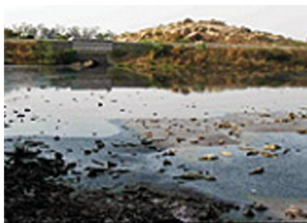
Fig. 18.9 : Industrial waste discharged into a river

Many industries discharge harmful chemicals into rivers and streams, causing the pollution of water (Fig. 18.9). Examples are oil refineries, paper factories, textile and sugar mills