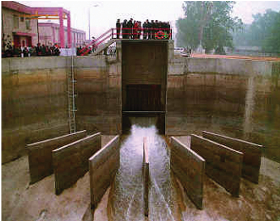
Fig. 18.10 : Water treatment plant

water used for washing vegetables may be used to water plants in the garden.