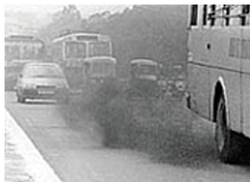
Fig. 18.3 : Air pollution due to automobiles

Vehicles produce high levels of pollutants like carbon monoxide, carbon dioxide, nitrogen oxides and smoke (Fig. 18.3). Carbon monoxide is produced from incomplete burning of fuels such as petrol and diesel. It is a poisonous gas. It reduces the oxygen-carrying capacity of the blood.