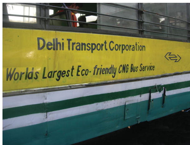
Fig. 18.5 : A public transport bus powered by CNG

Global warming can cause sea levels to rise dramatically. In many places, coastal areas have already been flooded. Global warming could result in wide ranging effects on rainfall patterns, agriculture, forests, plants and animals. Majority of people living in regions which are threatened by global warming are in Asia. A recent climate change report gives us only a limited time to keep the greenhouse gases at the present level. Otherwise, the temperature may rise by more than 2 degrees Celsius by the end of the century, a level considered dangerous.