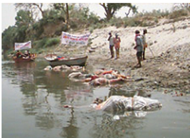
Fig. 18.8 : A polluted stretch of the river Ganga

Let us take a specific example to understand the situation. The Ganga at Kanpur in Uttar Pradesh (U.P.), has one of the most polluted stretches of the river (Fig. 18.8). Kanpur is one of the most populated towns in U.P. People can be seen bathing, washing clothes