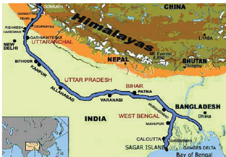
Fig. 18.7 : Course of the river Ganga

Ganga is one of the most famous rivers of India (Fig. 18.7). It sustains most of the northern, central and eastern Indian population. Millions of people depend on it for their daily needs and