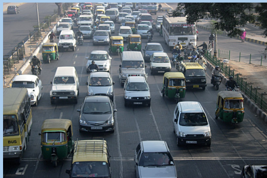
Fig. 18.1 : A congested road in a city