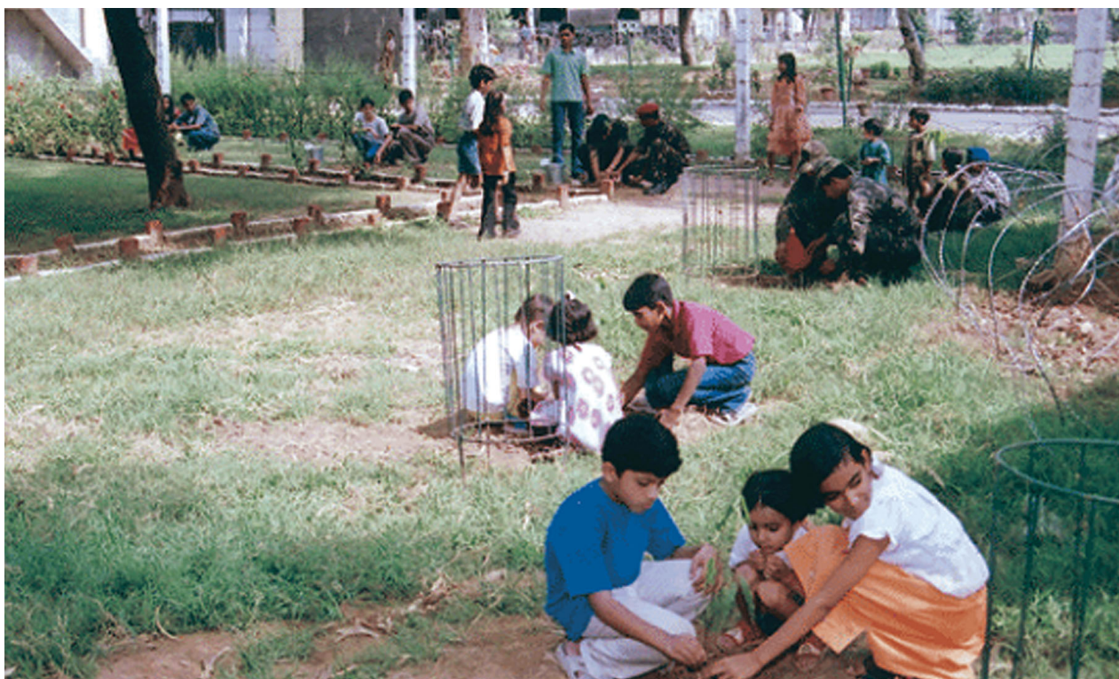
Fig. 18.6 : Children planting saplings

Small contributions on our part can make a huge difference in the state of the environment. We can plant trees and nurture the ones already present in the neighbourhood. Do you know about Van Mahotsav , when lakhs of trees are planted in July every year (Fig. 18.6)?