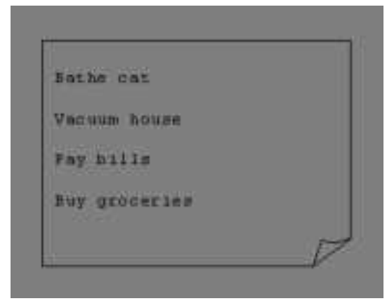
Exercise 2# Deconstructing an XML Document

12. Draw a tree representation of the structure.