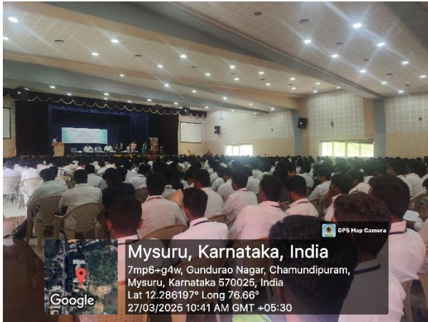
Mysuru, Karnataka, India 7mp6+g4w, Gundurao Nagar, Chamundipuram, Mysuru, Karnataka 570025, India Lat 12.286197° Long 76.66° 27/03/2025 10:41 AM GMT +05:30