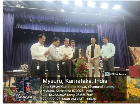
Mysuru, Karnataka, India 7mp5+6vw, Gundurao Nagar, Chamundipuram, Mysuru, Karnataka 570025, India Lat 12.286042° Long 76.659796° 27/03/2025 10:40 AM GMT +05:30