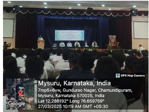
Mysuru, Karnataka, India 7mp5+6vw, Gundurao Nagar, Chamundipuram, Mysuru, Karnataka 570025, India Lat 12.286192° Long 76.659759° 27/03/2025 10:19 AM GMT +05:30