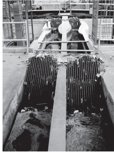
Fig. 18.3 Bar screen