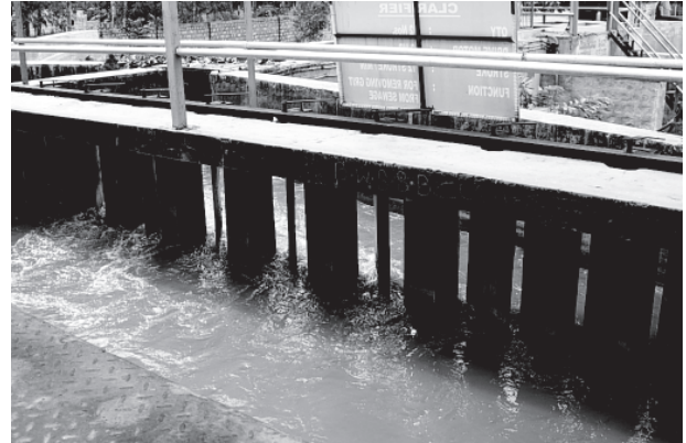
Fig. 18.4 Grit and sand removal tank