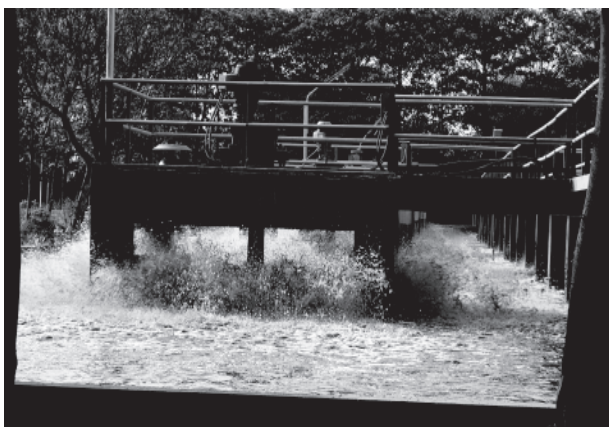
Fig. 18.6 Aerator

After several hours, the suspended microbes settle at the bottom of the tank as activated sludge. The water is then removed from the top.