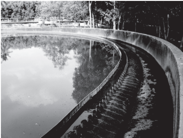
Fig. 18.5 Water clarifer

The sludge is transferred to a separate tank where it is decomposed by the anaerobic bacteria. The biogas produced in the process can be used as fuel or can be used to produce electricity.