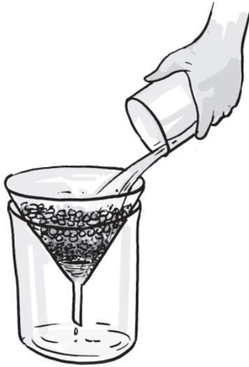
Fig. 18.2 Filtration process