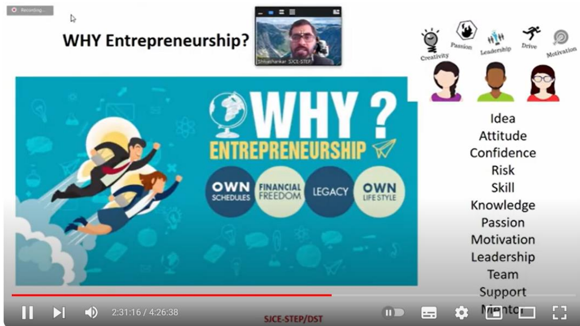
One day online workshop on Entrepreneurship and Skill Development